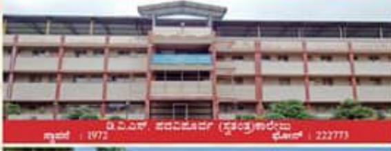
ಇ.ವಿ.ಎಸ್. ಪದವಿಪೂರ್ವ (ಪ್ರಾಂತ್ಯ) ಕಾಲೇಜು ಸ್ಥಾಪನೆ : 1972 ಫೋನ್ : 222773