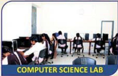
COMPUTER SCIENCE LAB