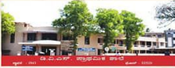
ಇ.ವಿ.ಎಸ್. ಕಲಾ, ವಿಜ್ಞಾನ ಮತ್ತು ವಾಣಿಜ್ಯ ಕಾಲೇಜು ಸ್ಥಾಪನೆ : 1963