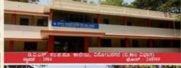
ಇ.ವಿ.ಎಸ್. ಸಂವಹನ, ಕಾರಣಿ, ಬಸವೇಶ್ವರ (ದಿ.ಕಂ.ವಿಭಾಗ) ಸ್ಥಾಪನೆ : 1984 ಫೋನ್ : 248919