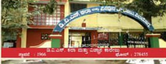
ಇ.ವಿ.ಎಸ್. ಕಲಾ ಮತ್ತು ವಾಣಿಜ್ಯ ಕಾಲೇಜು ಸ್ಥಾಪನೆ : 1966 ಫೋನ್ : 278455