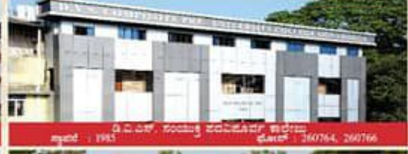
ಇ.ವಿ.ಎಸ್. ಕಂಪ್ಯೂಟರ್ ಪದವಿಪೂರ್ವ ಕಾಲೇಜು ಸ್ಥಾಪನೆ : 1985 ಫೋನ್ : 260764, 260766