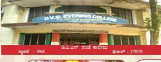
ಇ.ವಿ.ಎಸ್. ಸಹಿ ಕಾರಣಿ ಸ್ಥಾಪನೆ : 1968 ಫೋನ್ : 278371