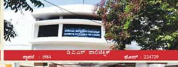
ಇ.ವಿ.ಎಸ್. ಪಾಲಿಟೆಕ್ನಿಕ್ ಸ್ಥಾಪನೆ : 1984 ಫೋನ್ : 224729