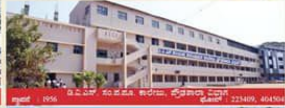
ಇ.ವಿ.ಎಸ್. ಸಂವಹನ, ಕಾರಣಿ, ಪ್ರೌಢಶಾಲಾ ವಿಭಾಗ ಸ್ಥಾಪನೆ : 1956 ಫೋನ್ : 223409, 404504