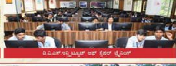
ಇ.ವಿ.ಎಸ್. ಇನ್ಫರ್ಮೇಷನ್ ತಾಂತ್ರಿಕ ಕ್ಷೇತ್ರದ ಕ್ಷೇತ್ರ