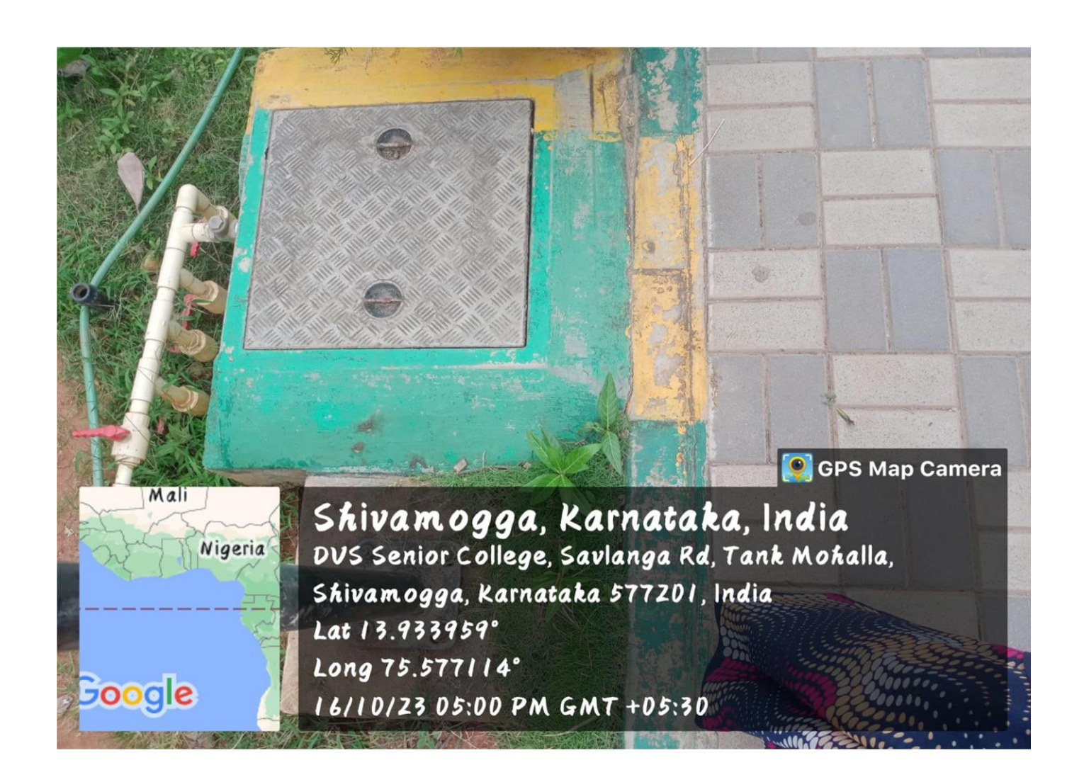
OPEN WELL RECHARGE

(Accredited from National Assessment & Accreditation Council at the A Level) Sir M.V. Road, Post Box No.81, SHIVAMOGGA-577201, Karnataka State