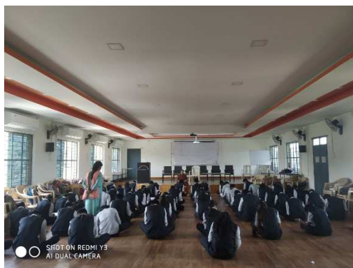
Practicing how to write a mail