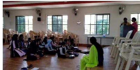
Essay writing practice