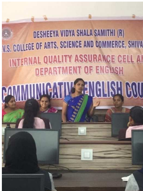
Welcome speech by HoD