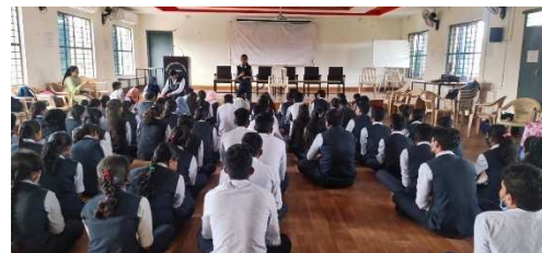
Speech by student