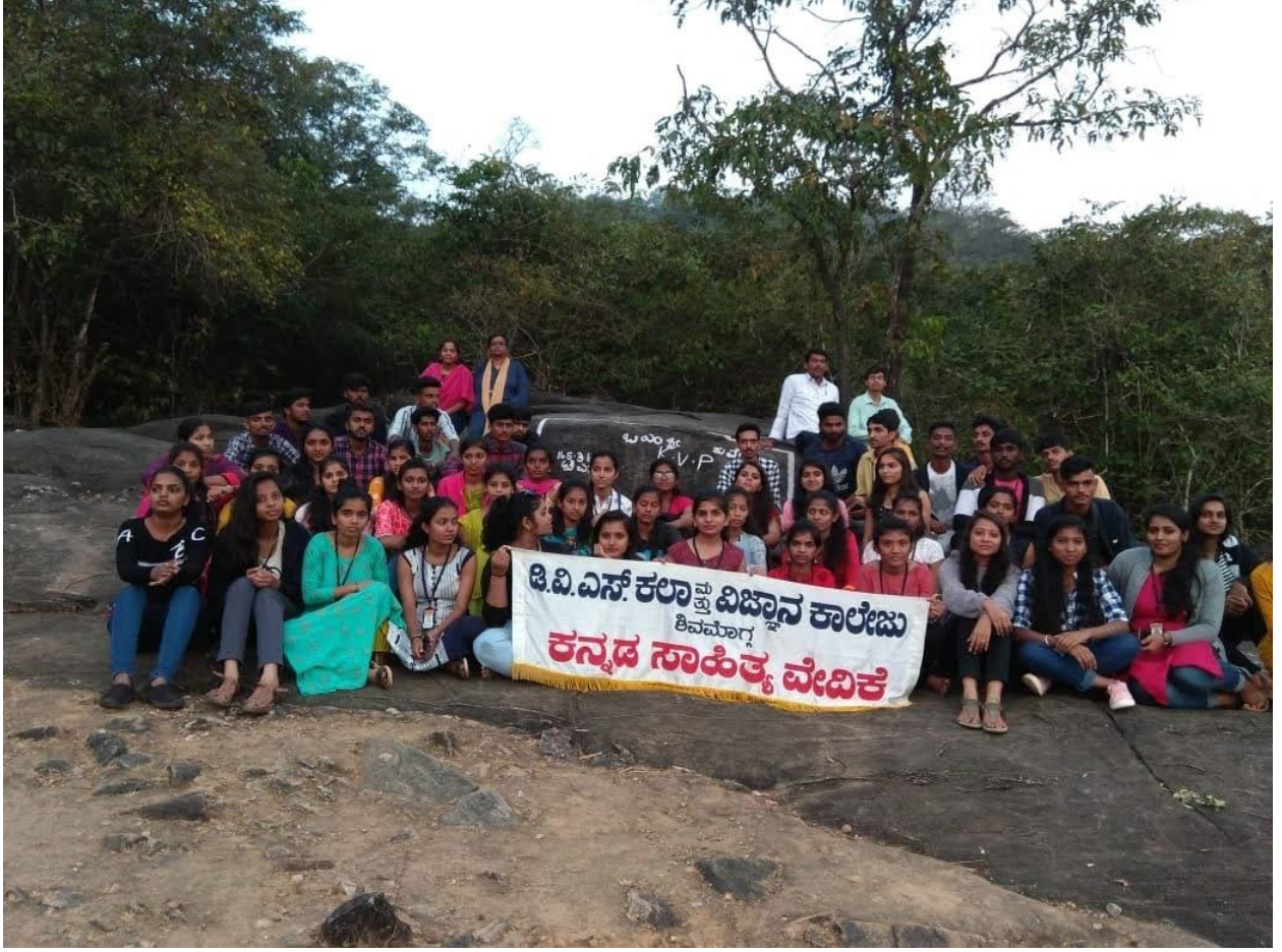
FIELD VISIT TO KUPPALLI