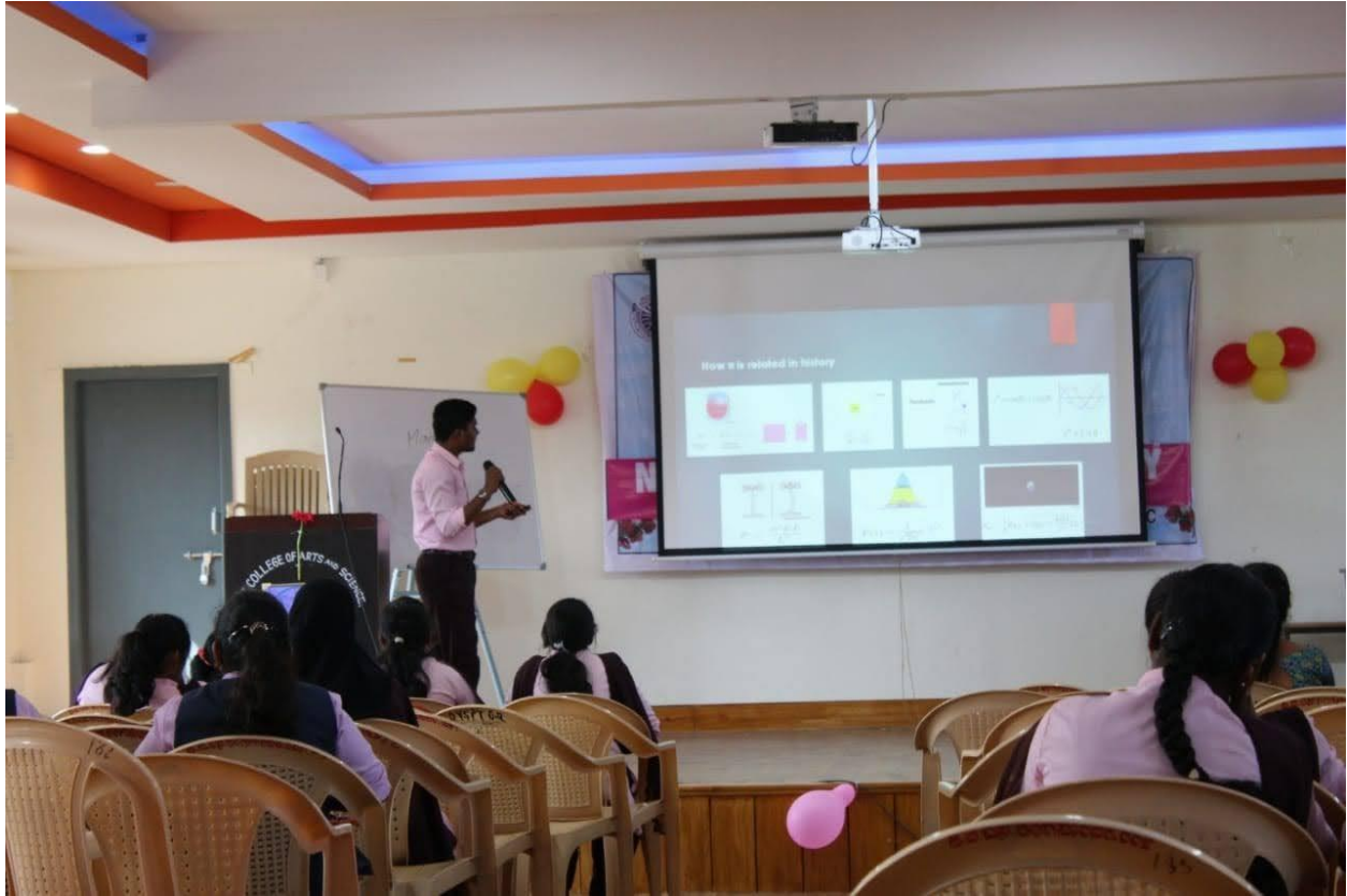
ADVANCED LEARNER PRESENTING PPT