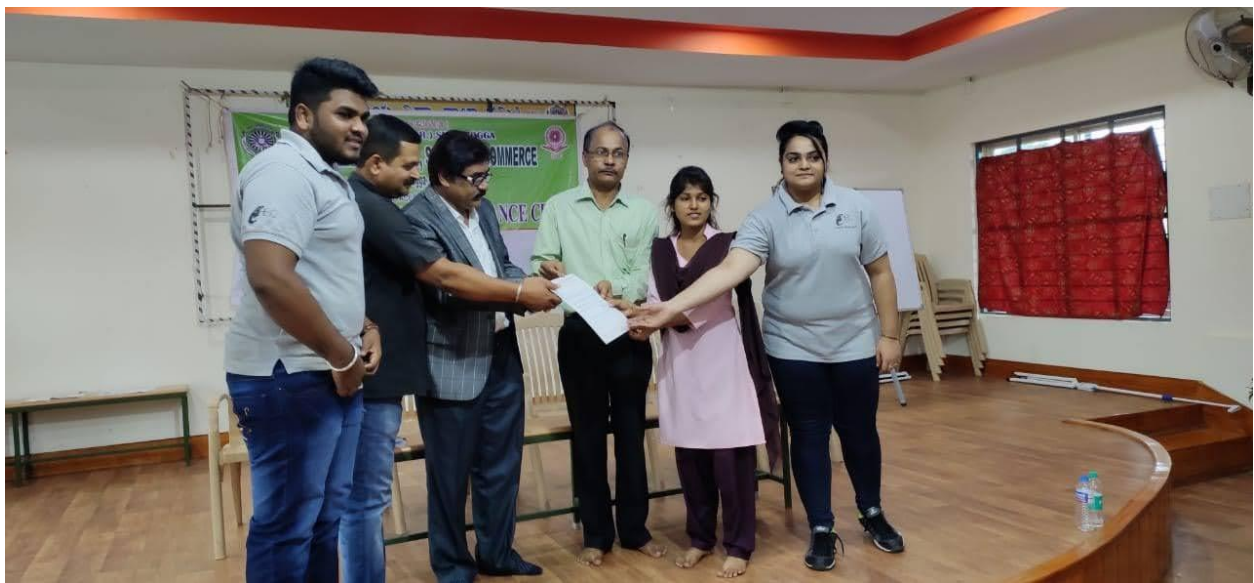
PLACEMENT ACHEIVERS BEING AWARDED WITH OFFER LETTERS